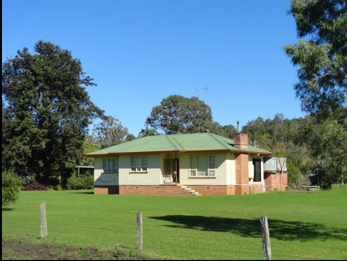
1 OF 2 TIMBER HOMESTEADS