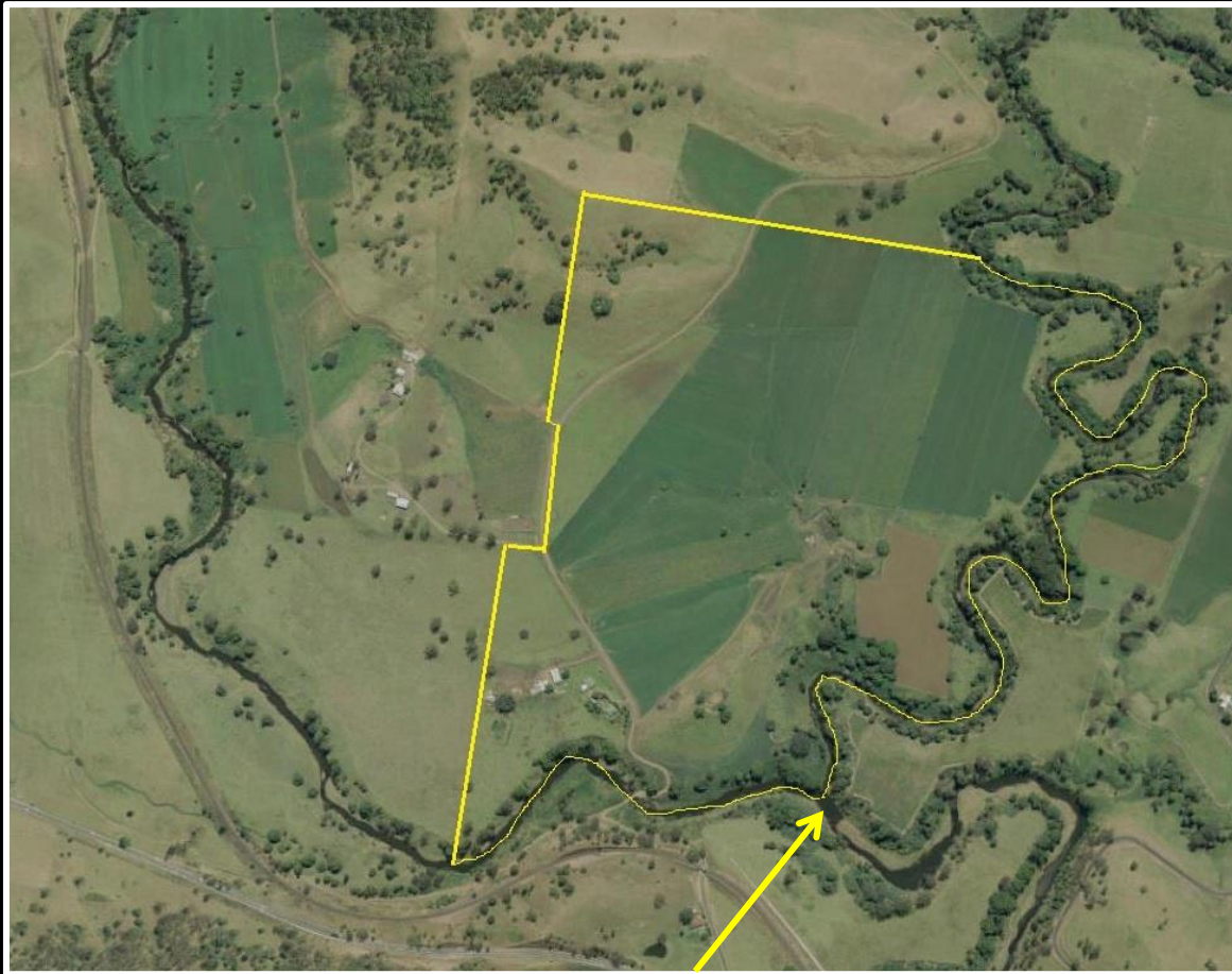
JUNCTION OF BOTH LYNCHS CREEK & THE RICHMOND RIVER