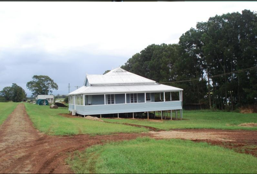
No. 1 – Timber Homestead