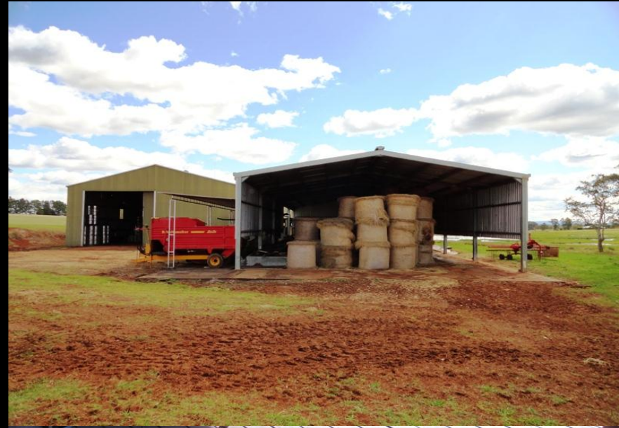
2 of 3 Sheds