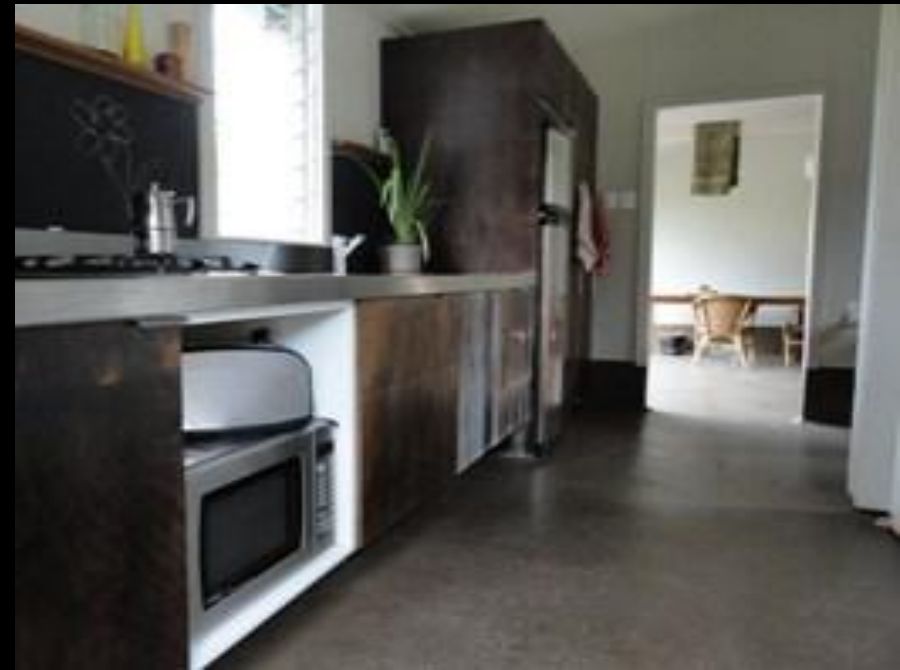
All the Modern Conveniences