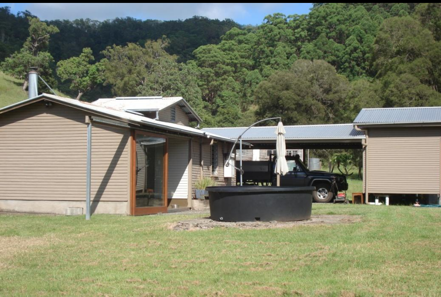
Converted Dairy & Outbuildings