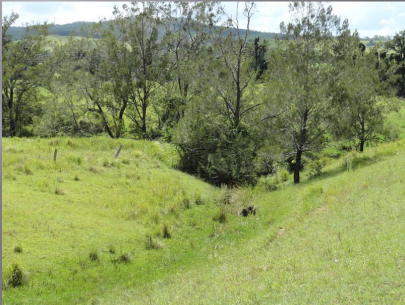
View Towards Creek