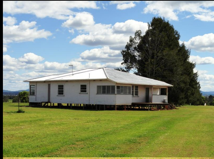
House on Lot 5