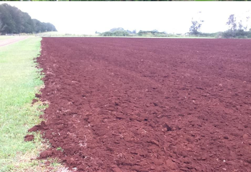
“Deep Red Volcanic Soils”