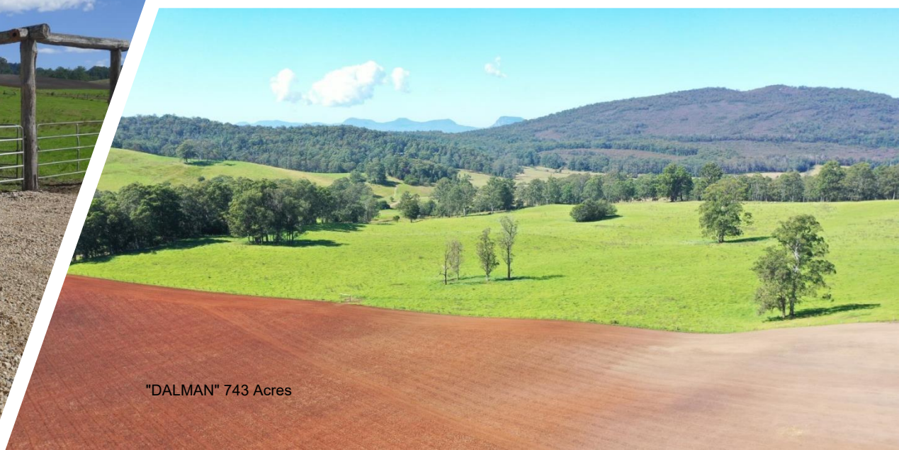
"DALMAN" 743 Acres