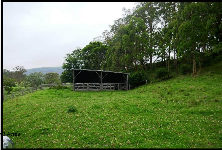
"DALMAN" 743 Acres